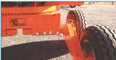
Adjustable tandem axle