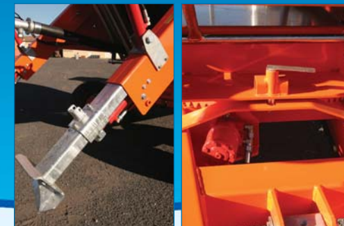
Hydraulic stabilisers and rotation of the turntable