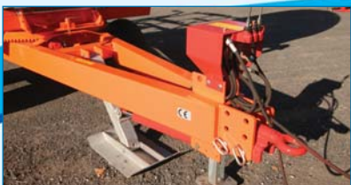
Retractable front jack