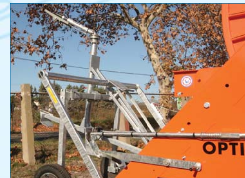
Standard automatic trolley lifting