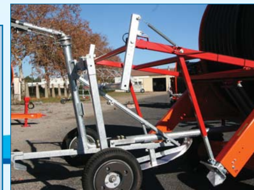
Lifting of the trolley connected to the hydraulic lifting of the stabilizers (Premium type)